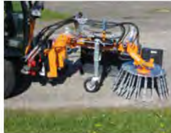
Here shown with support wheels